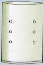
Multiple Hole punch