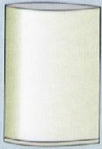
Standard bottom seal