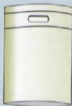
Twin seal with Handle punch